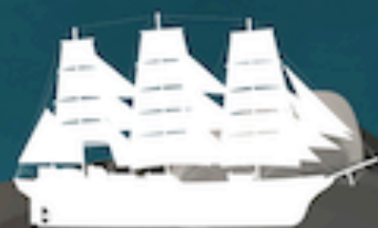
The Schooner Series